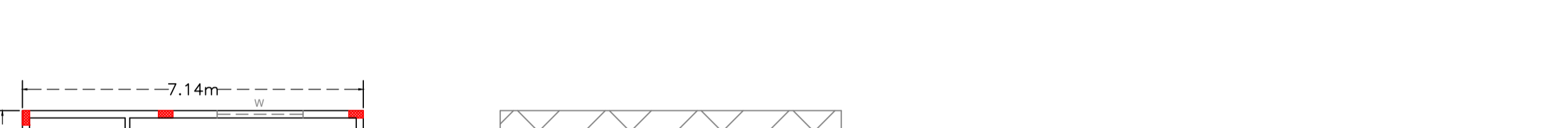
GROUND FLOOR PLAN (Proposed) (SCALE 1:100) TERRACE FLOOR PLAN (SCALE 1:100)